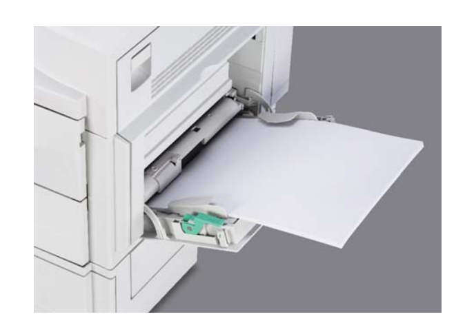
Print or copy onto labels, overhead transparencies, postcards and other unique stocks with the 100-sheet Bypass Tray.